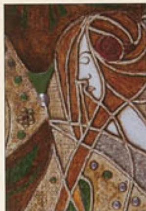
FROM A RECENT GESSO PANEL HIGHLIGHTING THE GLOW EMITTED BY PURE WHITE GESSO WHEN FOILED BY A CAREFULLY PAINTED BACKDROP.