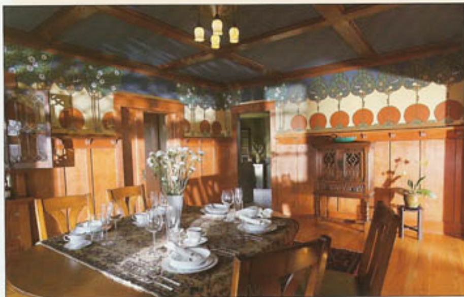
"THE FOREST EVERGREEN" FRIEZE WAS DESIGNED FOR A CLIENT IN THE PACIFIC NORTHWEST AS A WELCOME RESPITE AT THE END OF A HECTIC WORK DAY.